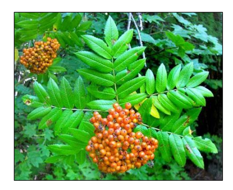
Mountain ash Sorbus scopulina

This Source Guide is organized by cities in Montana. Plant nomenclature is based on Lesica P., 2012. Manual of Vascular Plants of Montana . Brit Press. 771 pages. Appendix A is a Seed Certification primer. The Index contains a list of businesses featured in this guide.