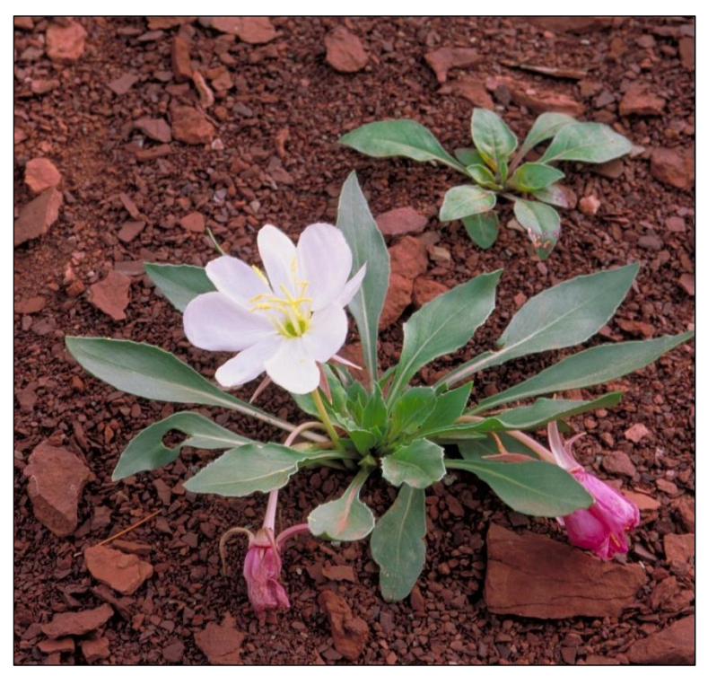
Gumbo Lily Oenothera cespitosa

MNPS Landscaping & Revegetation Committee Updated April 4, 2024