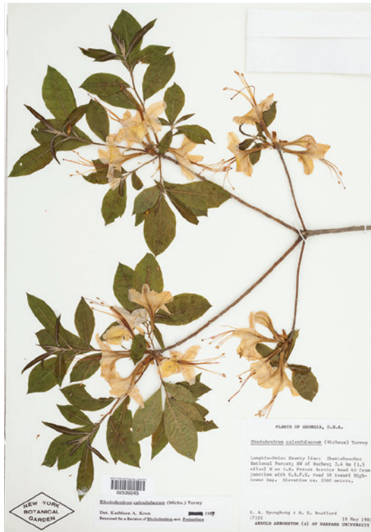
Examples of a rhododendron (above) and a hydrangea (below) from the New York Botanical Garden Steere Herbarium.